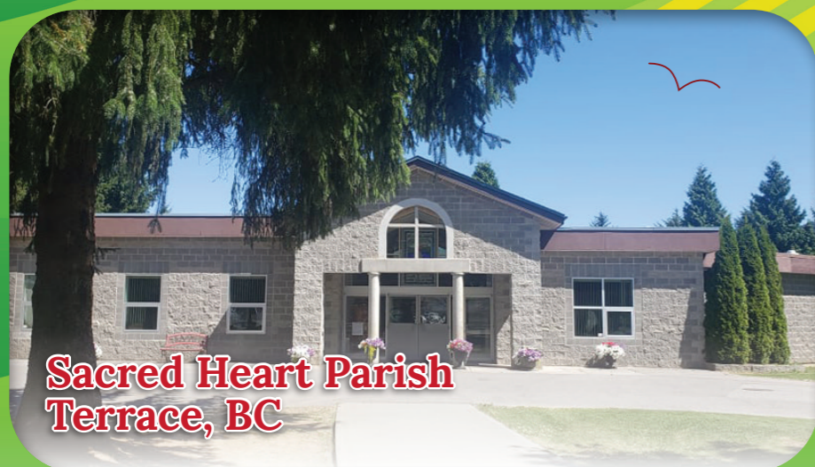
Sacred Heart Parish Terrace, BC