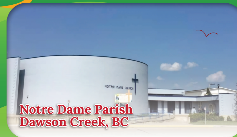
Notre Dame Parish Dawson Creek, BC

Pilgrimage is of course a fundamental element of every Jubilee event. Setting out on a journey is traditionally associated with our human quest for meaning in life. A pilgrimage on foot is a great aid for rediscovering the value of silence, effort and simplicity of life. In the coming year, pilgrims of hope will surely travel the ancient and more modern routes in order to experience the Jubilee to the full...In the particular Churches, special care should be taken to prepare priests and the faithful to celebrate the sacrament of Confession and to make it readily available in its individual form.